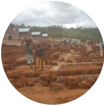
A beneficiary of Rwanda VI project

"I am very satisfied with the quality of my house, especially seeing as it is the first house which has ever been mine and that no one in my family has ever had a house like it. For me, this house is an answer from God, and it is fantastic, with three bedrooms, cement, electricity and drinking water. In all honesty, I am incredibly satisfied, and I would like to thank everyone who contributed to the help that came our way."